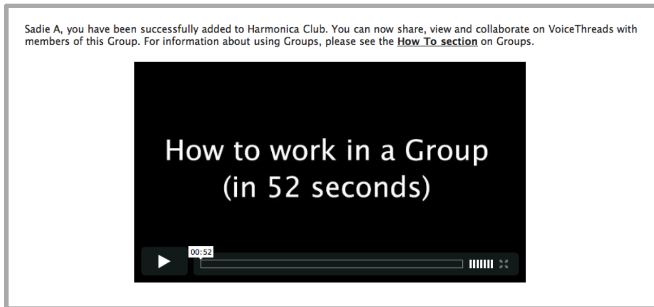
Figure 2: Joining a Group

If you are not yet a member of the appropriate Course Group, you'll need to join it by clicking the Group sign-up link. This is a link provided by your instructor. As soon as you click this link and sign into your VoiceThread account, you'll see a confirmation that you were added to the Group.