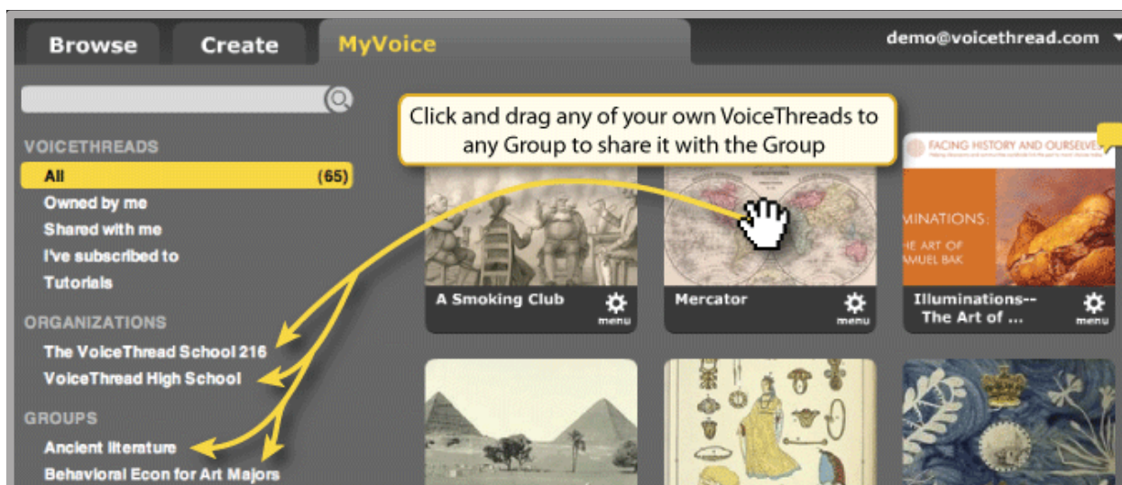
Figure 3: Sharing with a Group

The simplest way to share VoiceThreads with the Group is the Drag-n-Drop sharing method on the MyVoice page. Just click and drag any of your own VoiceThreads to the name of the Group on the left side of the page. The VoiceThread will instantly be shared with that Group, so all members will be able to view and comment on it.